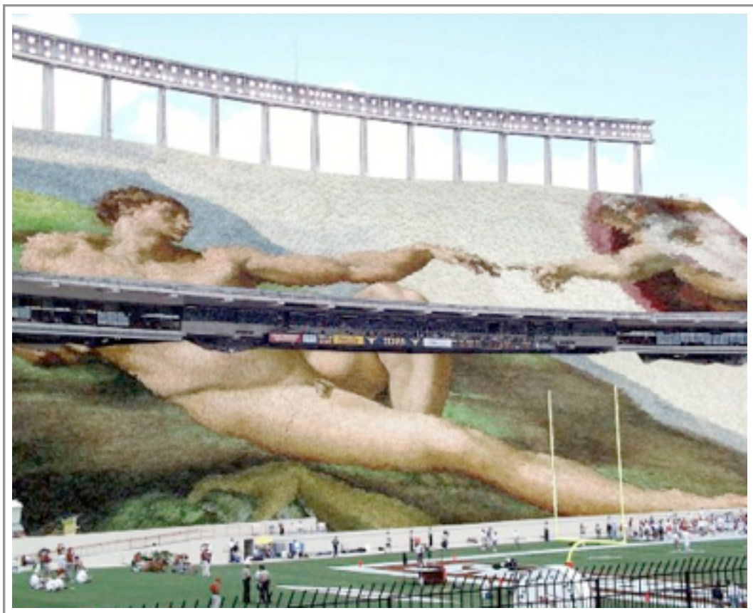
Figure 1: Flashcards at a stadium

Neural networks can identify, store and retrieve patterns. These patterns inhere in the network itself, and not in the individual nodes. Figure 1 illustrates this in a simple way: